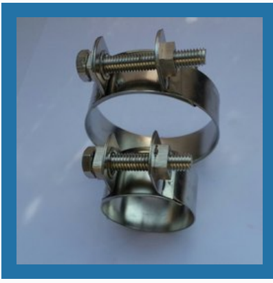
Heavy Duty Clamp