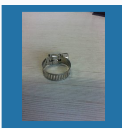
1/2 Inch Mini Hose Clip