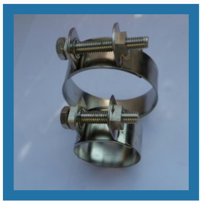
Galvanized Hose Clamp