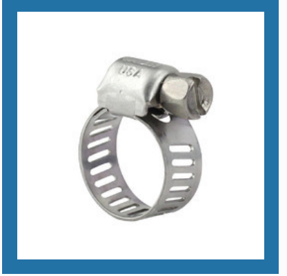
Mini Hose Clamp