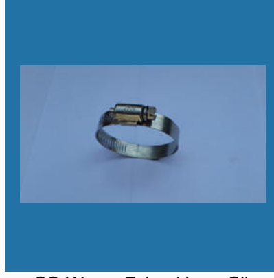
SS Worm Drive Hose Clip