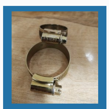
MS Hose Clamp